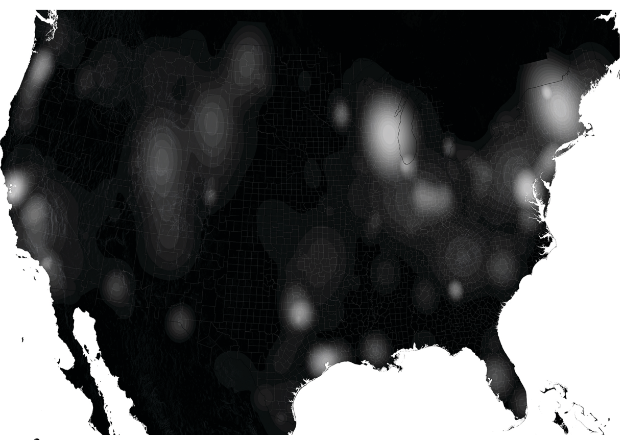
Figure 3: Atmospheric Sensing Heatmap Composite. Composite heatmap showing concentrations of active sensor locations including sensors of all five types. Dark areas suggest blindspots in environmental monitoring. (Map by POST–Project for Operative Spatial Technologies, 2021)