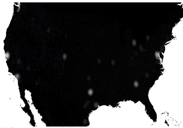
c.) Neighborhood Scale Sensor Distribution